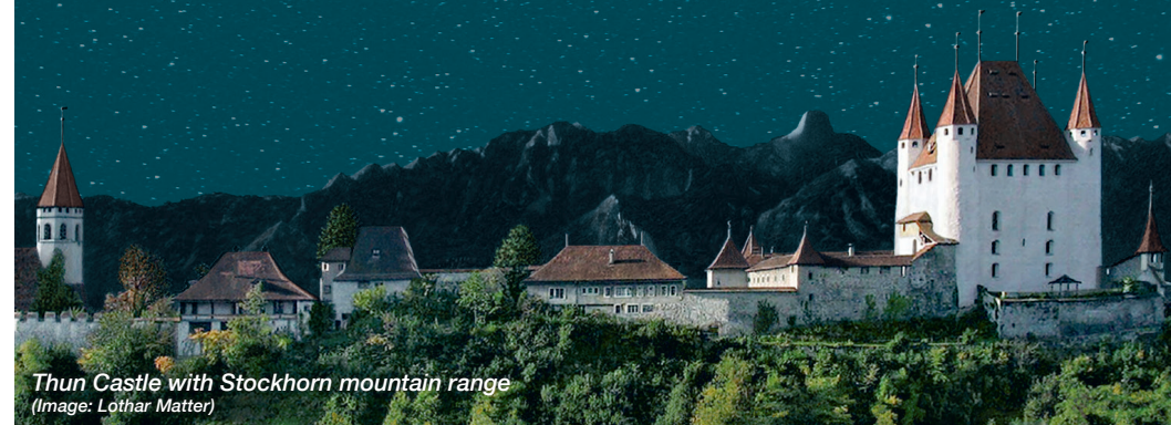
Thun Castle with Stockhorn mountain range

Friday 23 August - Sunday 25 August 2024